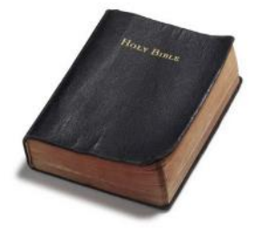
The Bible is the Word of God